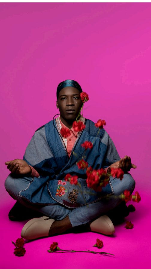
KIMONO -KAPTIAL GLOBAL @KAPITALGLOBAL SHIRT -FRANKIE MORELLO MILANO-@FRANKIEMORELLO SCARF -TED BAKER @TEDBAKER