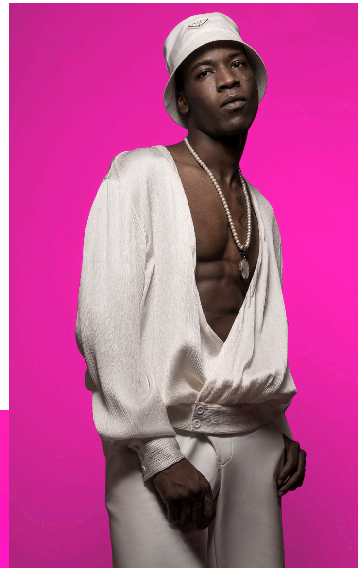
BUCKET HAT -PRADA @PRADA NECKLACE - STYLIST OWN SILK WHITE SHORT SET - EDWING D'ANGELO @EDWINGDANGELO